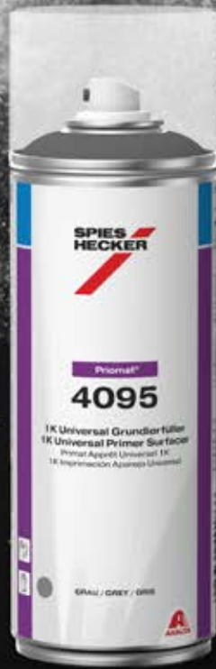
SPIES HECKER PRIOMAT 1K UNIVERSAL PRIMER -SURFACER 4095 GREY