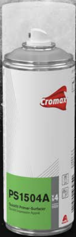
CROMAX QUICKFILL PRIMER-SURFACER PS1504A GREY