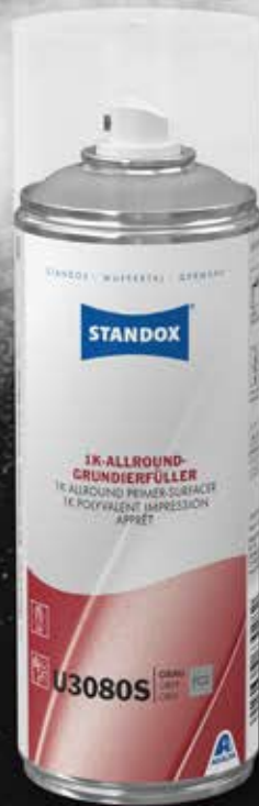
STANDOX 1K ALLROUND PRIMER-SURFACER U3080S GREY