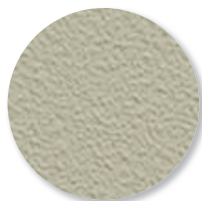
AAS Buff PFT696T0025

Alesta Anti-Skyd products are formulated as Super Durable TGIC-polyesters, and can also be made as custom products in Epoxy, Hybrid, and HAA chemistries. This product is available in 25 pound boxes.