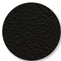
AAS Jet PFB748T0025