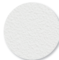
AAS Frost PFW771T0025