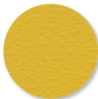
AAS Citron PFY723T0025